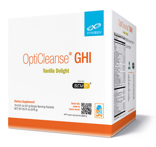
Available in Vanilla Delight, Creamy Chocolate, and Chai