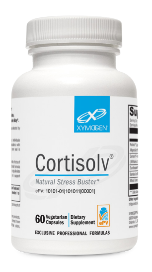
Available in 60 and 120 capsules